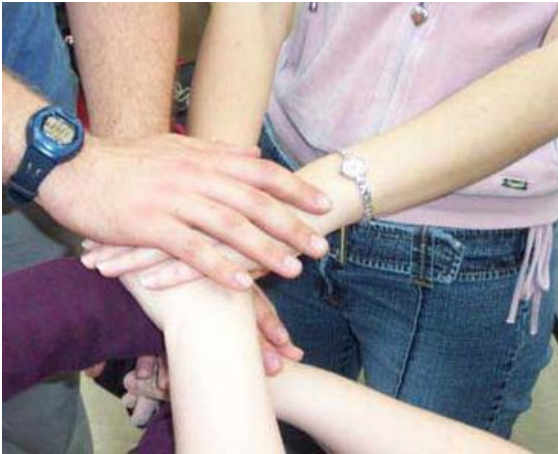
Figure 2 Applied Visual Arts means close collaboration.

Many people will understand the term 'applied arts' to mean glass, ceramics, furniture, graphic design, architecture and so on and in a lot of contexts that is accurate, but that is not what is meant by applied visual arts as it is taught and practiced in the North of Finland. The key word is 'applied', it implies something useful, relevant and suitable to a particular context, visual art that is produced following a careful contextual investigation and interpretation, almost always in collaboration with others; community groups, business partners or both.