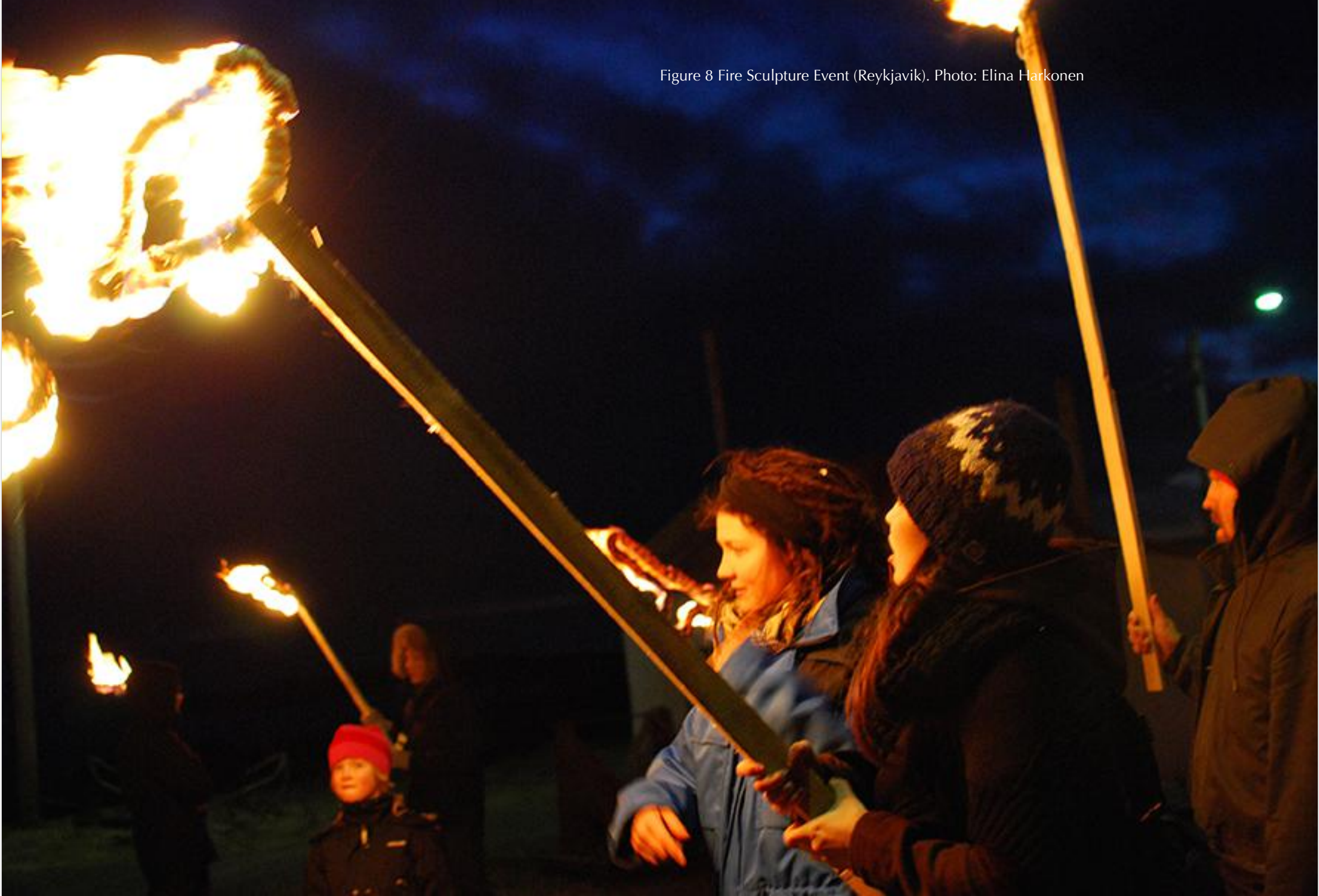
Figure 8 Fire Sculpture Event (Reykjavik).