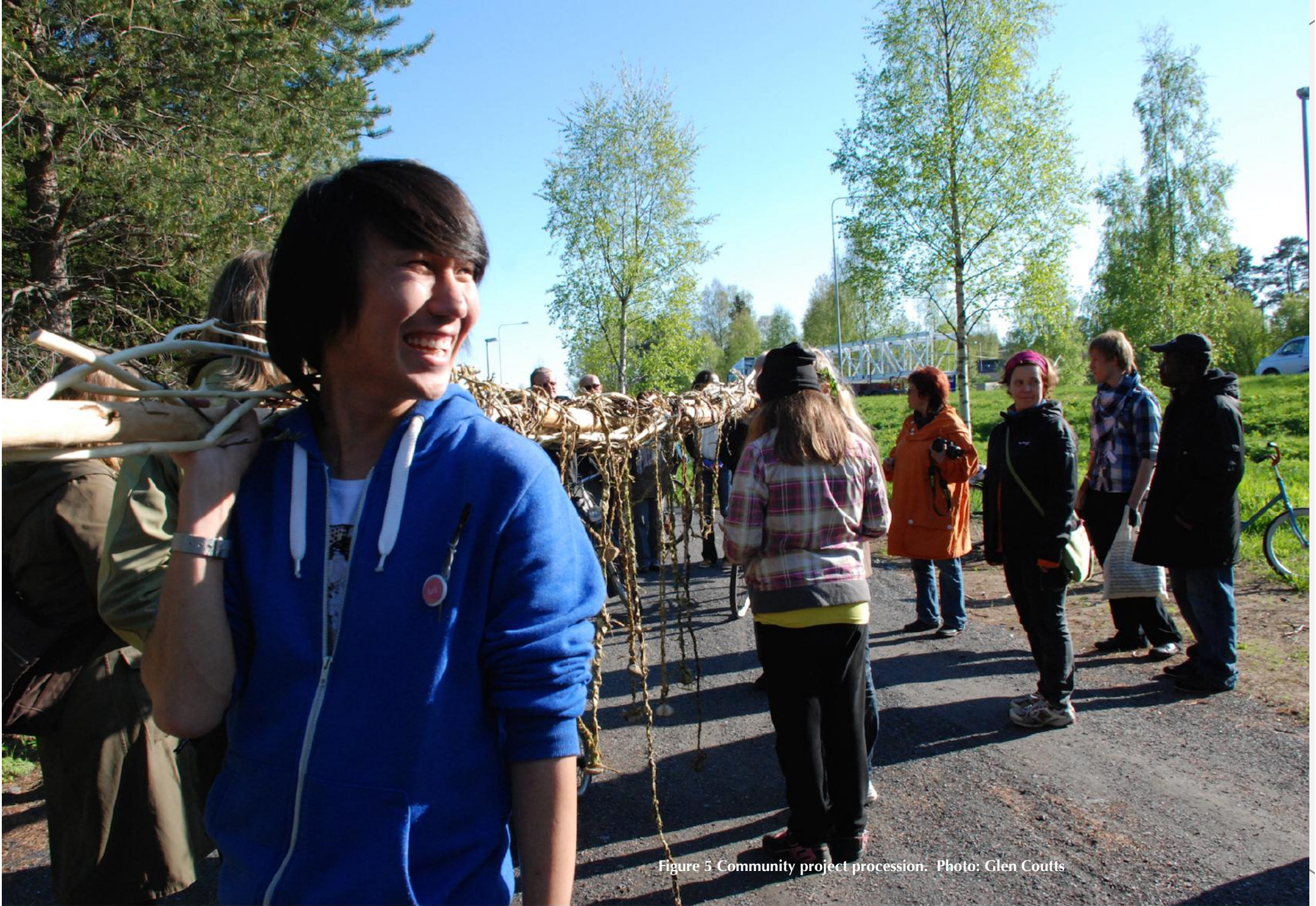
Figure 5 Community project procession.