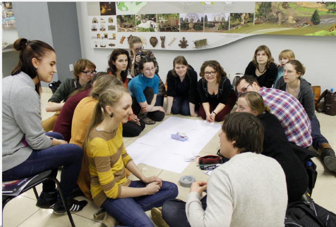
Figure 9 Working in Groups (Syktyvkar, Rovaniemi, Lahti and Helsinki).

The key characteristics of Applied Visual Art include an emphasis on process rather than product; active rather than passive engagement with issues and problems; the artist as facilitator - emphasis on developing the skills of others within the context of a community setting. As a result, AVA might be seen not only as a particular form of arts practice, but also as an inclusive and powerful model of learning. AVA also has much in common with design disciplines for example service design, participatory design, co-creation and user generated design.