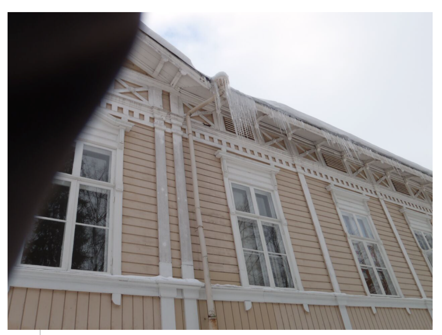
Figure 4. Spring weather.

In the example below, Anna explains that she wants to capture the beautiful spring weather, because it is an important source of her happiness and positive emotions (Figure 4). According to Anna, it has not been an easy task, and she explains how she has engaged in creative problemsolving to document this abstract experience.