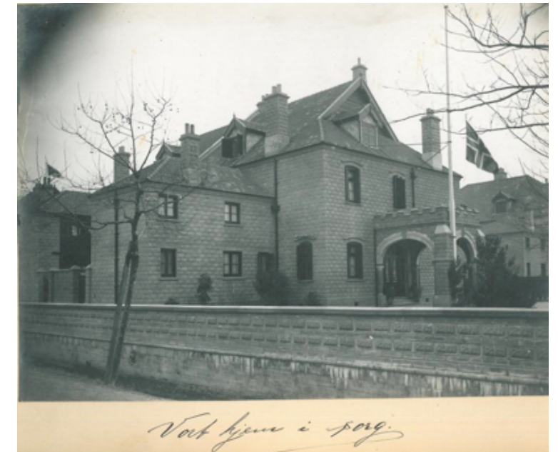
Fig. 22: Shanghai House II

Most likely due to Thorvald's death, the national flag of Norway at his house was at half -mast (Fig. 22).