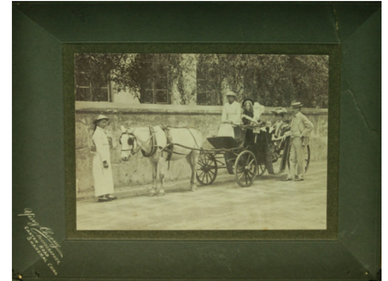
Fig. 11: Koren family, 1909, Shanghai

family albums. Some words are written on the left bottom of the photograph board "Ying Cheong, PHOTOGRAPHER, CANTON ROAD, SHANGHAI, CHINA."