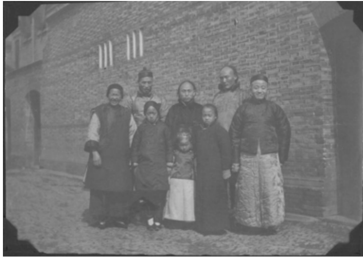
Fig. 12: The servants, 1910, Shanghai

Fig. 13 is Koren children with Chinese children. Erling II and Leif wear Sami fur. The Chinese children wear traditional mandarin cotton-padded jacket. All of them are dressed up.