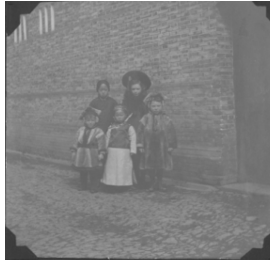
Fig. 13: Bibi and brothers with Chinese children, 1910, Shanghai

Fig. 13 is Koren children with Chinese children. Erling II and Leif wear Sami fur. The Chinese children wear traditional mandarin cotton-padded jacket. All of them are dressed up.