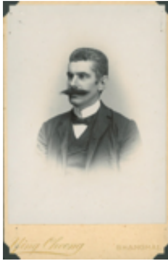
Fig. 2: Erling, 1904, Shanghai

Ying Cheong (英昌), Pow Kee & Co. (寶記), Sze Yuen Ming & Co. (耀華), and K. T. Thompson (同生) was four famous photographic studios in Shanghai in the beginning of the 20th century (Cheng, 2013).