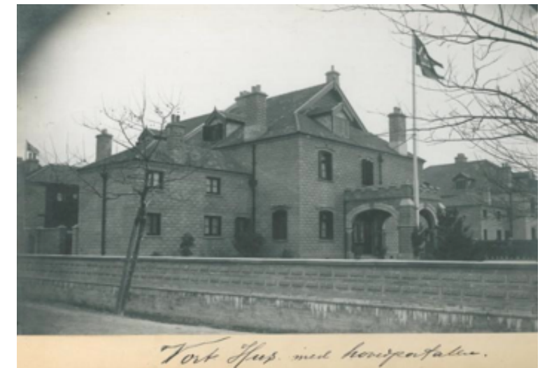
Fig. 19: Shanghai House I