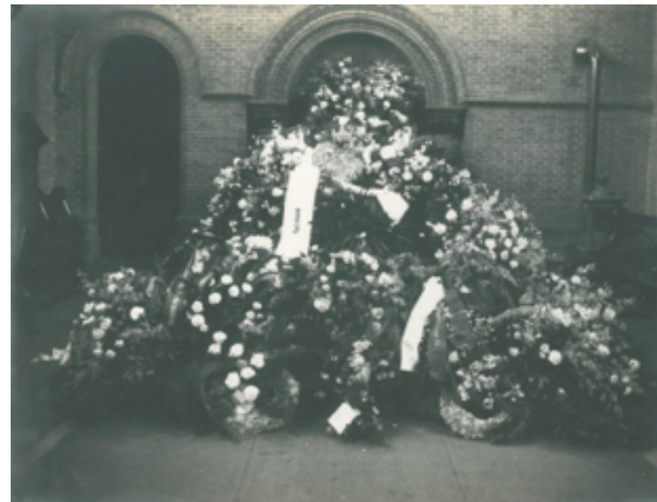
Fig. 21: The flowers at Thorvald's funeral, 1914, Shanghai

Thorvald passed away soon after (Fig. 21). Gyda married Erling with very different personalities for 14 years (1898-1912). Gyda remarried Thorvald and was much happier, but the time was so short. She became a widow at the age of 42.