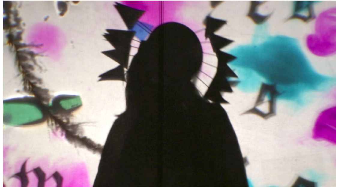
Still frame from "Inside Me"