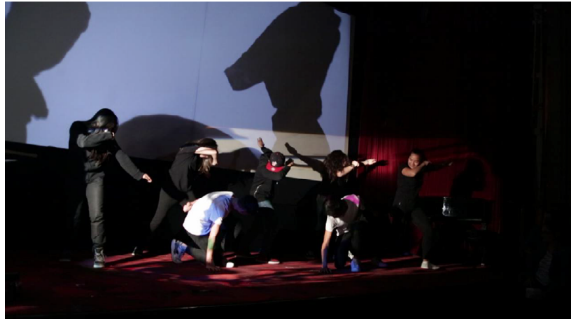
Students working on "Inside Me", respond to a shared soundtrack using light, masks, text and body

The participation happened on a voluntary basis: The students were free to engage in and move between the workshops as they saw fit, taking breaks as they wished. The only common rules were, that no one disrupted anybody else's work flow and that everyone needed to refer to the shared soundtrack when creating content.