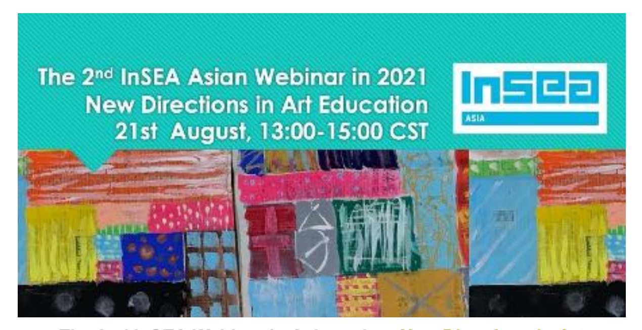
The 2nd InSEA Webinar in Asia region. New Directions in Art Education: Museum and gallery education in Asia